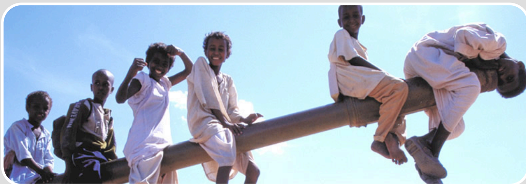
Kids playing on a tank barrel in Northern Sudan