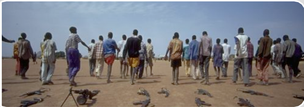
A successful a disarmament program in southern Sudan